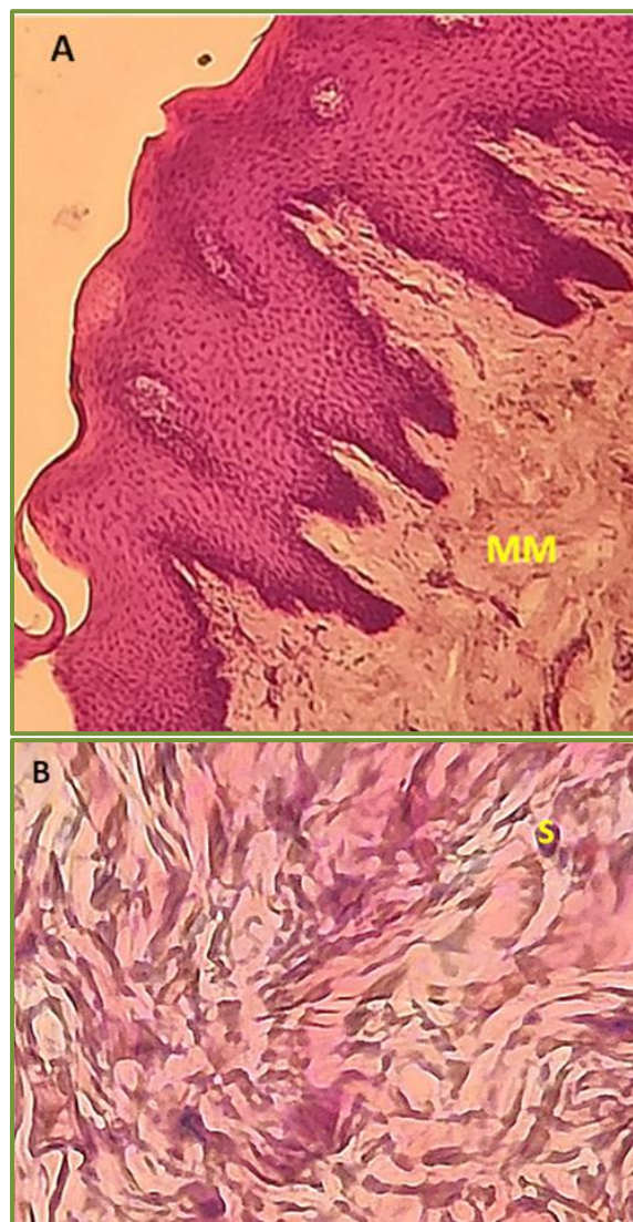
Figure 2: Histopathological Images of the Tongue in Camels Infected with Sarcocystis Stained with Hematoxylin and Eosin (H&E) Image A. Low Magnification (X200). The stratified squamous epithelium overlying the muscularis of tongue is intact with some papillary projections, Muscularis (MM): inner multilayered layer of tongue. Image B. High Magnification (X400). Sarcocystis cysts are clearly demarcated by septae and bradyzoites.

Superimposed Sarcocystis cysts at high magnification (X400): internal septations and bradyzoites (S) in the muscularis layer are clear (high parasitic load).